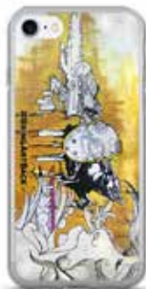
Mural iPhone Cases $22.45