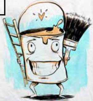
Volunteer Sign up