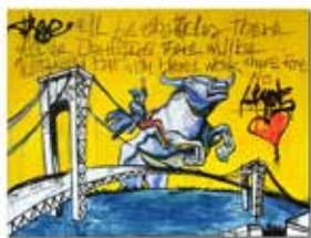
No Limits by Artist Domingo Zapata Printed Canvas $125.00

When you wear, give, or use #BringArtBack merchandise, you represent the movement and help spread the message.