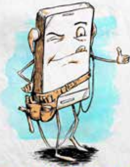
Social Media Toolkit