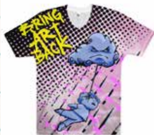
Collab Collection - Ed. 001 $45.00