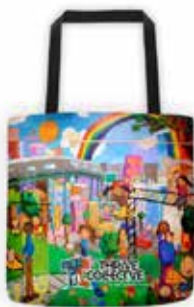
Mural Tote Bag $25.00